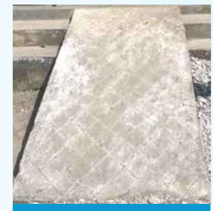
Location: A safe & accessible household toilet is close to home. It has easy access and non-slip path. The entry should be level if possible, or with a shallow ramp or steps

Interior: Provide strong handrails (wood or bamboo) attached to the walls at 70-90 cm height to provide support and balance to reach the seat or squat. A rope from the door or ceiling can also give support.