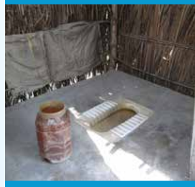
Space: An accessible toilet has enough space and light. The floor is not slippery & is easy to clean.

A Households may already have constructed their toilet, hence these suggestions are provided to make it more accessible. If there is no toilet yet, then the actual construction can be planned to be more appropriate for disabled persons, depending on their needs.