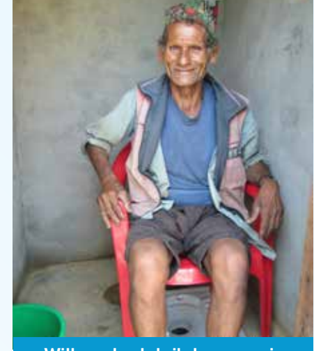
With a stool, toilet access is much easier and safer for elderly and disabled.