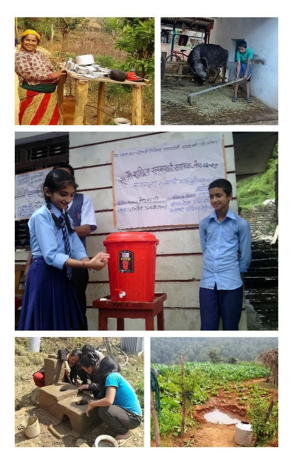
Total sanitation related behaviours promoted by RWSSP-WN

Depending on the target group and the strategic approach chosen, there can be even 40 different messages depending on the target group. Some of the new or improved methods include, for example, targeted letters to households to have them commit to construct toilets, seeking the support of local political and other leaders to create an enabling environment and to agree on nosubsidy, more eye-catching posters in carefully thought exposure points, correctly timed monitoring and follow-up visits etc. Many V-WASH-CCs are now better motivated to lead the VDC sanitation and hygiene campaigns.