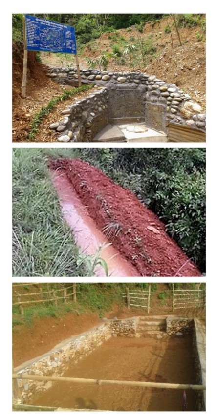
Runoff diversion wall (above), recharge trench and pond (below)

Water Safety Plan (WSP), which is one of the elements in the Post-Construction phase, is the main tool for maintaining and improving the service level of rural water supply projects. The concept of WSP applied by RWSSP-WN II was revised during the FY02 to mainstream Climate Change Adaptation and Disaster Risk Reduction considerations within the plan (WSP+) and to include regular operation & maintenance (O&M) and tariff calculation (WSP+). By the end of FY03, 204 WSPs have been prepared for piped gravity and lift water supply schemes in nine project districts . Coliform Presence/Absence (P/A) tests during WSP preparation reveal that 40% of water supply systems are contaminated with bacteria . These results are worrying, and emphasize the importance of WSP++. In case of presence, it is possible that the water is contaminated also with other bacteria, parasites and parasitic worms, although these parameters are not tested.