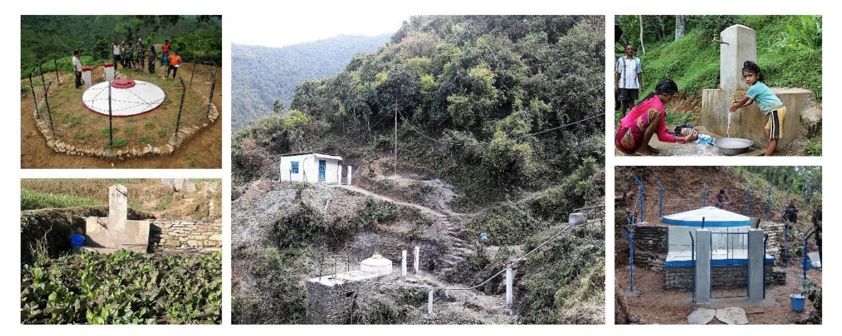
Structures of gravity and electric lift water supply schemes

By the end of its 3<sup>rd</sup> fiscal year, RWSSP-WN II has supported 84,221 people to gain access to improved water supply . In addition to completed rural water supply projects, we have a number of on-going projects with a population of 53,998. Most of our schemes are based on gravity-flow of water in piped water supply system, serving households through community taps shared by a few households. However, there is an increasing demand for lifting water to hardship communities in areas where gravity-based water supply is not feasible; to locations where depletion of water sources in higher slopes (i.e. communities who were earlier served by gravity-based water supply systems) is evident. Other technical options for water supply are rain water harvesting, point source improvements (usually without piped system), and, in the Terai context, wells and overhead-tanks. Construction work in the first half of the fiscal year was slowed down due to the blockade of Nepal-India border and unrest in Terai, but accelerated towards the end of the fiscal year.